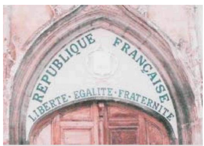
Jakoben laikliğin neye benzediğini en iyi gösteren resimlerden biri budur: Fransa'da bir kilise; kapısında Fransız Cumhuriyeti ve eşitlik kardeşlik özgürlük yazılı

"The first of the principles of French Republic is freedom; The first of the freedoms is the freedom of conscience; to support religion monetarily is insisting something to the citizens other than their own beliefs and it is unethical;